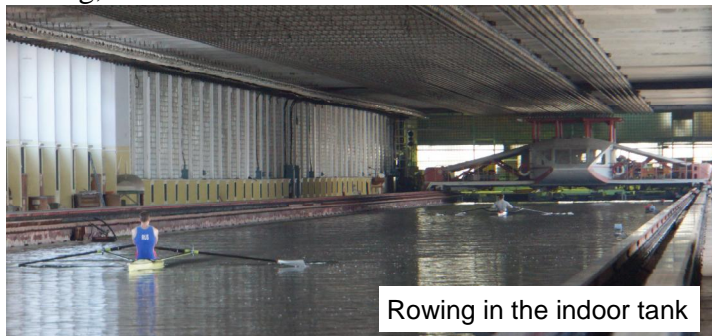
Rowing in the indoor tank

The purposes of the test were to define the drag factors DF of each boat using two methods: rowing and towing, and then to find their correlation.